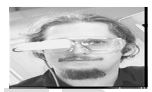
Fig 1:A smart eye glass that display images and reqired information [3]

It is a hands free display system that is wore on eyes just like glasses. It has lenses that can act as a display unit. Its interface consists of a touch pad, a camera and a communication device. Through this you can see data graphs and other information on the position where ever you are working .Recently Google has also launched a prototype of its wearable display device that can be operated with the help of a ring in a finger. [4]