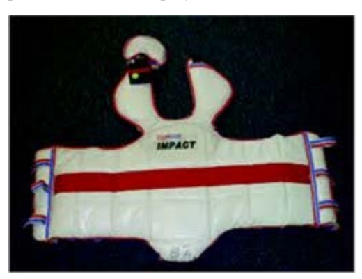
Fig 7: The TrueScore SensorHogu used to overcome the problem of scoring [14]

Wearable coputing enhances the level of soprts by increasing the accuracy in the results along with improving the performance of the players.