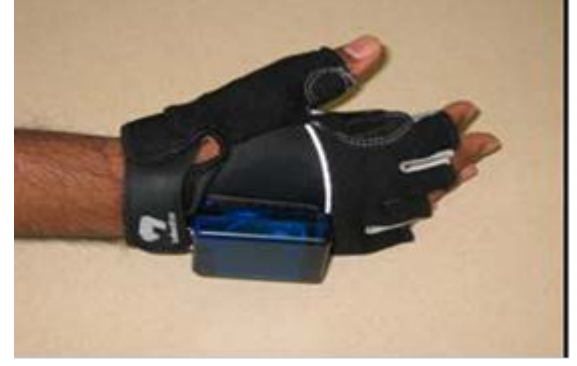
Fig2: iGlove with RFID reader that gives information about what item the user is touching with his hand [5]

It is a data Glove embedded with RFID (Radio frequency identification) reader which measures the motion of the hand and displays it in its displaying unit that what item the user is touching from his hand and fingers. All the items, where these iGlove are used, are equipped with RFID tags which give the information about the item to the user on their iGlove display.