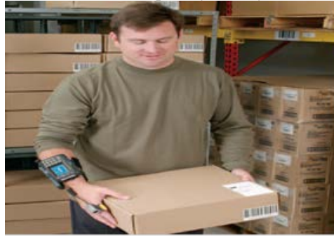
Fig 3:A Ring scanner with wrist mounted wearable computer that frees the both hands of the worker while scanning the products [9]